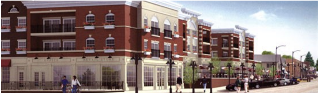
A Village combining retail, entertainment and living all within easy walking distances

It's not just a home; it's a LifeStyle that makes the best Impression.